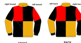
Playing shirt for Under 7s to Under 12s

FOR TRAINING ..... RUGBY BOOTS/TRAINERS, SOCKS SHORTS/TRACK SUIT BOTTOMS (No zips!) T SHIRT/RUGBY TOP/SWEAT SHIRT GUM SHIELD AND SHIN PADS